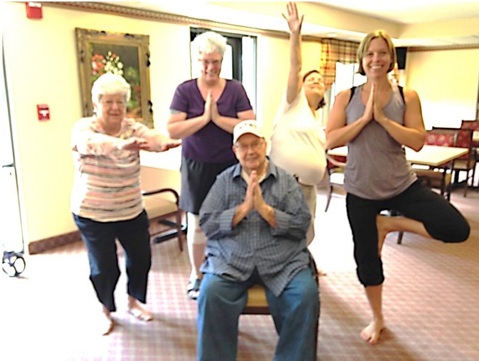
LEADING THE WAY IN CARING FOR OUR NEIGHBORHOOD SENIORS